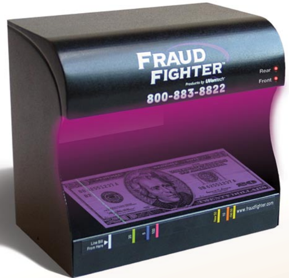
With Fraud Fighter™ Verification